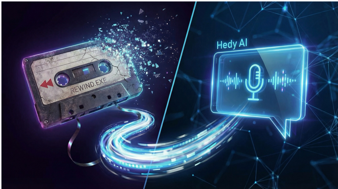
Split illustration of a crumbling cassette tape labeled Rewind transforming into the Hedy AI microphone icon

Read this article online: https://www.hedy.ai/post/export-limitless-data-to-hedy/